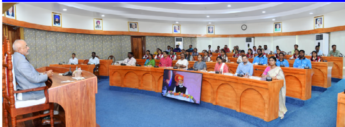
Admiral D K Joshi, PVSM, AVSM, YSM, NM, VSM (Retd.), Hon'ble Lt. Governor, A&N Islands and Vice-Chairman, Islands Development Agency attended the live streaming address of Hon'ble Prime Minister of India, Shri Narendra Modi on the occasion of National Youth Day being organized by Mera Yuva Bharat commemorating the 161 st Birth Anniversary of Swami Vivekananda, Youth Icon of India with active participation of youths of Port Blair and renowned sports persons of Andaman and Nicobar Islands.